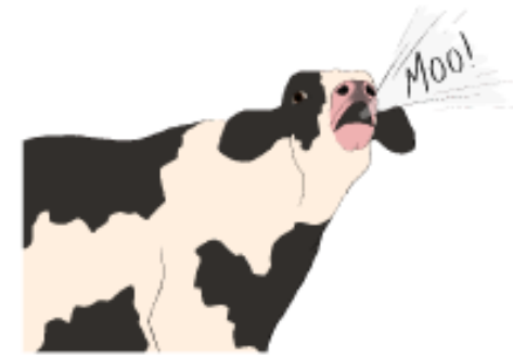
1) Restlessness & bellowing