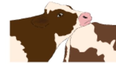
6) Chin resting